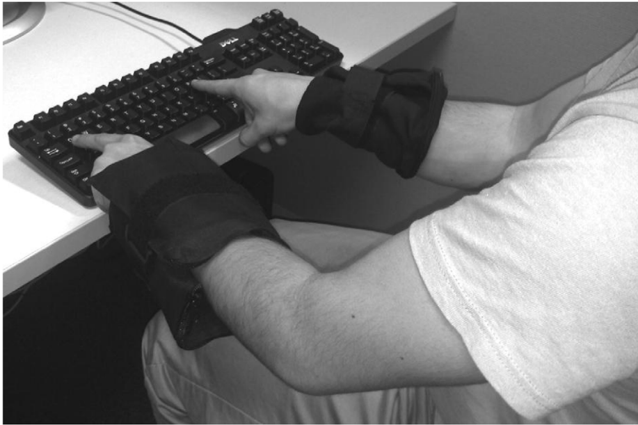
Figure 1. Experimental setup (shown here: Left condition). As can be seen in this photograph, the participant wore casings on both wrists. In this example, it is the left-wrist casing that contains the 5-lb. weight. doi:10.1371/journal.pone.0058381.g001

right-handers versus left-handers.] For both the strongly right-handed and weakly right-handed groups, slopes in all three conditions mirrored those for the full sample. Specifically, slopes differed significantly from zero in the Baseline condition, whether participants were strongly right-handed ( M = -10.38 ms/digit, SD = 15.24 ), t(11) = 2.36 , p = .04 , or weakly right-handed ( M = -7.67 ms/digit, SD = 8.26 ), t(11) = 3.22 , p = .01 , and in the Right condition, whether participants were strongly right-handed ( M = -14.94 ms/digit, SD = 17.19 ), t(11) = 3.01 , p = .01 , or weakly right-handed ( M = -10.03 , SD = 15.21 ), t(11) = 2.28 , p = .04 . In contrast, slopes did not differ significantly from zero in the Left condition for either group (strongly right-handed: M = 0.00 ms/digit, SD = 10.76 ; weakly right-handed: M = 0.50 ms/digit, SD = 13.66 ; both p s > .9 ). Moreover, in all three conditions, slopes