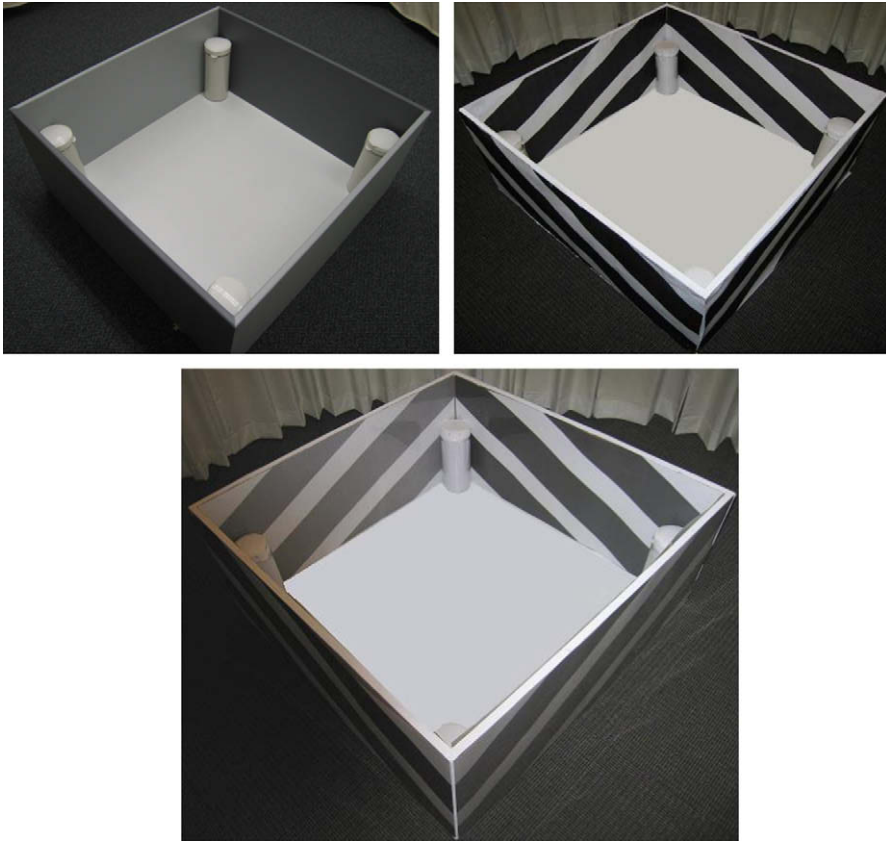
Fig. 2. Photographs of the squared-shaped spaces used in Experiment 1. Top: The two groups involving isolated dimensions (left: luminance; right: line orientation). Bottom: The group involving composite information (luminance plus line orientation).

chose between one of two small toys (a dog or a duck) to hide. All children entered the circular enclosure through an opening in the curtain that, when shut, left no visible markings. On each trial, the child stood inside the square space and watched the experimenter hide the toy in one of the containers. (The experimenter always stood outside the space, reaching in to hide the toy.) Following the hiding event, the parent stepped inside the box, picked up the child, covered the child's eyes, and spun him or her around, completing approximately four revolutions. After the disorientation procedure, the child was placed in front of one of the walls (a different wall on each trial, randomly determined) and encouraged to find the hidden toy. (The parent always stood outside the box during search, moving around so as not to serve as a cue to the hidden toy's location.) Although the child was permitted to search for the toy until he or she found it, only the first selection was scored for accuracy. Across trials, the toy was hidden in the same corner (counterbalanced across children). If children searched at the hiding corner, the trial was terminated. If children searched at one of the other corners, they were encouraged to keep searching. There were a total of six test trials, with the majority of children (75% across condition) completing at least five trials. The entire experiment took approximately 20 min.